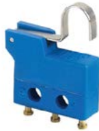
B2-5: Single Break Subminiature Basic Switch with Levers