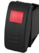
K5: Sealed Illuminated Rocker