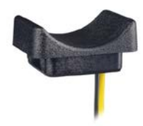
CS : Capacitive Touch Switch