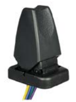
HPW : Hall Effect Single Axis Paddle