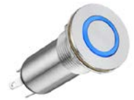
LP3V: Ring Lit Vandal Resistant Pushbutton