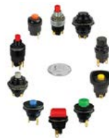
P7: Subminiature MIL-PRF-8805/110 Pushbutton