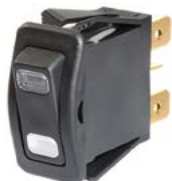
K1 : Sealed Rocker