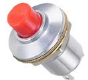
P3: Sealed Momentary Action or Push-Pull Button