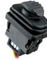
HTWS: Thumb Paddle Wheel with Seal Boot