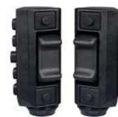
G3-E : Control Grip