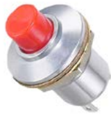
P3: Sealed Momentary Action Pushbutton