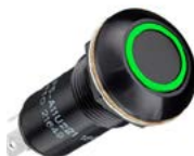
LP5-V : Vandal Resistant Alternate Action Pushbutton