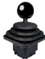
JHL: Cost Effective Sealed Joystick