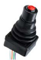
JHT : Miniature Joystick