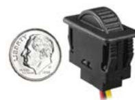
HTWS : Smaller Proportional Output Thumbwheel