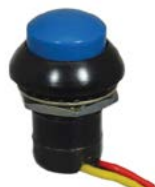
HP7 : Hall Effect Momentary Pushbutton