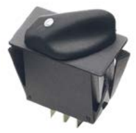
R2 : Sealed Rotary Switch with Illumination Options