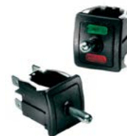
K4 : Sealed Snap-In Rocker