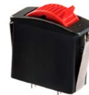
HTWE : Hall Effect Friction Actuation Thumbwheel