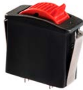
HTWE: Hall Effect Friction Actuation Thumbwheel