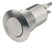
P5-V: Vandal Resistant Sealed Alternate Action