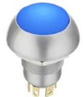
LP3S : Illuminated Shorter Behind Panel Momentary Action Pushbutton