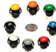
P7-D / P9: Sealed Momentary Action Pushbutton