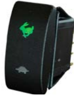
K5: Sealed Illuminated Rocker with Legends