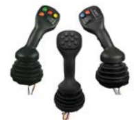
G3: Contour Grip