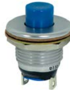
P8: Momentary Sealed Subminiature Pushbutton