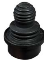
HTL4: 4-Way Finger Joystick