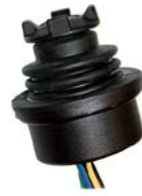
HTL4: 4-Way Finger Joystick