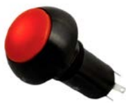
LP3 : Illuminated Sealed Momentary Action Pushbutton