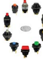
P7: Subminiature Sealed Pushbutton