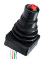
JHT: Miniature Joystick