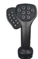
G3-CK : Universal Grip