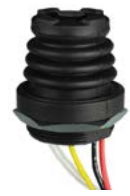
HTLT2: 2-Way Finger Joystick with Pushbutton Option