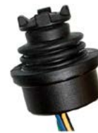
HTL2 / HTL4: 2-Way and 4-Way Finger Joysticks