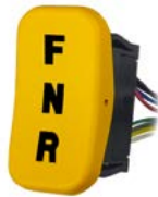
K1S: Sealed ON-ON Triple Throw Rocker