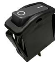
K1: Sealed Rocker