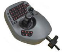
WP: Operator Control Module