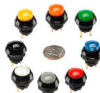
P7-D / P9 : Sealed Momentary Action Pushbutton