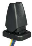
HPW: Hall Effect Single Axis Paddle