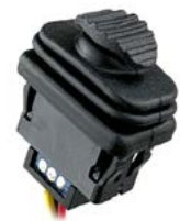
HTWS : Thumb Paddle Wheel with Seal Boot