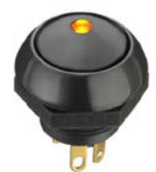
LP9 : Illuminated Sealed Momentary Action Pushbutton