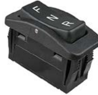
K1S: FNR Rocker