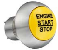
P3-D: Sealed Momentary Action Pushbutton