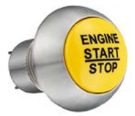
P3-D : Sealed Momentary Action Pushbutton