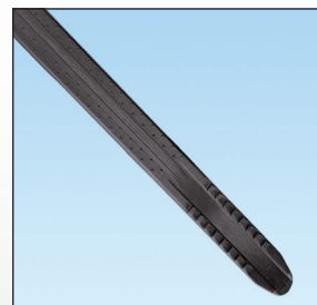
Anti-slip strap body and finger tip grip