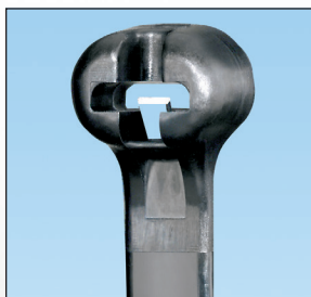
Dome-top head with smooth, round edges