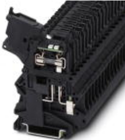
Lever-type fuse terminal block, black, for 5 x 20 mm G fuse inserts, with LED for 24 V DC

Please be informed that the data shown in this PDF Document is generated from our Online Catalog. Please find the complete data in the user's documentation. Our General Terms of Use for Downloads are valid ( http://phoenixcontact.com/download )