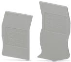
Cover segment, length: 94 mm, height: 39.3 mm, color: gray

Please be informed that the data shown in this PDF Document is generated from our Online Catalog. Please find the complete data in the user's documentation. Our General Terms of Use for Downloads are valid ( http://phoenixcontact.com/download )