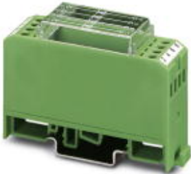
Diode module, with 4 diodes, individually wired, diode type 1N 4007

Please be informed that the data shown in this PDF Document is generated from our Online Catalog. Please find the complete data in the user's documentation. Our General Terms of Use for Downloads are valid ( http://phoenixcontact.com/download )