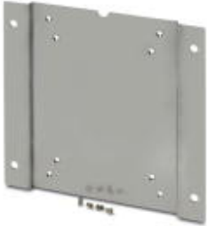
Mounting plate for FL SWITCH 30... and FL SWITCH 40... 16-port switches

Please be informed that the data shown in this PDF Document is generated from our Online Catalog. Please find the complete data in the user's documentation. Our General Terms of Use for Downloads are valid ( http://phoenixcontact.com/download )