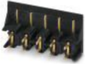
Contact strip for DIN rail connector

Contact strip - ME TBUS PST 1,5/ 5-3,81 THRR32 - 2914369