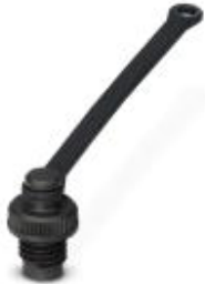
M8 sealing cap made of plastic with fixing band, for free M8 sockets, with 3.0 mm fastening eye

Please be informed that the data shown in this PDF Document is generated from our Online Catalog. Please find the complete data in the user's documentation. Our General Terms of Use for Downloads are valid ( http://phoenixcontact.com/download )