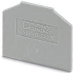
End cover, length: 43.5 mm, width: 1.5 mm, height: 34.3 mm, color: gray

Please be informed that the data shown in this PDF Document is generated from our Online Catalog. Please find the complete data in the user's documentation. Our General Terms of Use for Downloads are valid ( http://phoenixcontact.com/download )