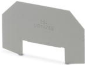
Separating plate, Width: 0.8 mm, Color: gray

Please be informed that the data shown in this PDF Document is generated from our Online Catalog. Please find the complete data in the user's documentation. Our General Terms of Use for Downloads are valid ( http://phoenixcontact.com/download )