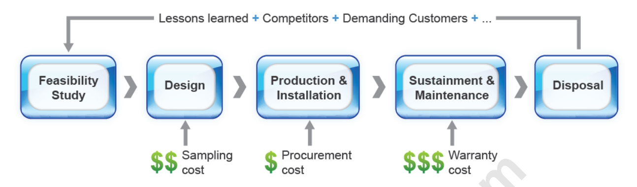
Fig. 1 - Product life cycle showing important costs for switching solutions

Fig. 1 shows three costs associated with a switching solution at different times. "Sampling cost" could be related to the purchase cost of a small quantity of the switching solution under consideration plus the lead time to obtain such samples for prototyping and trade off studies. "Procurement cost" is thought of as the initial purchase cost of a chosen switching solution after negotiations involving forecast and contractual terms. "Warranty cost" may occur during the last and longest phase of the life cycle and are highly dependent of the business model implemented for each company. More details about costs and how to account for them are presented in subsequent sections leading to a new paradigm where Solid State Relays may be considered more cost effective than other switching solutions.